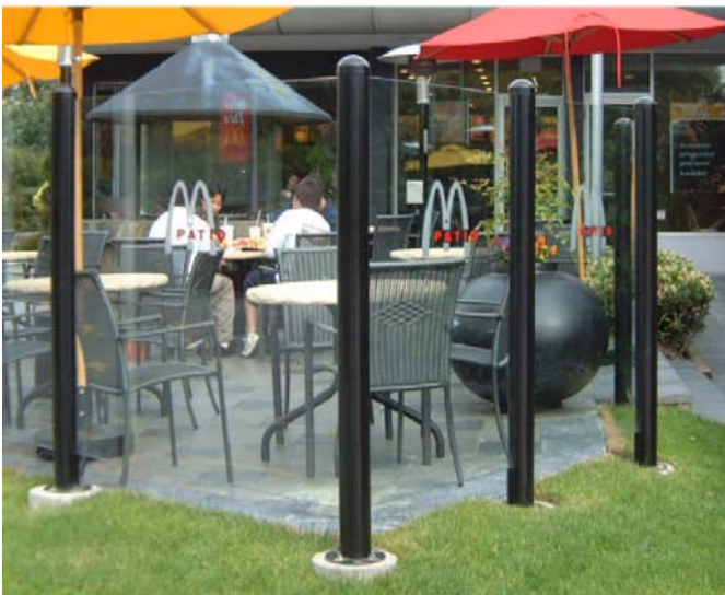
Close up Details